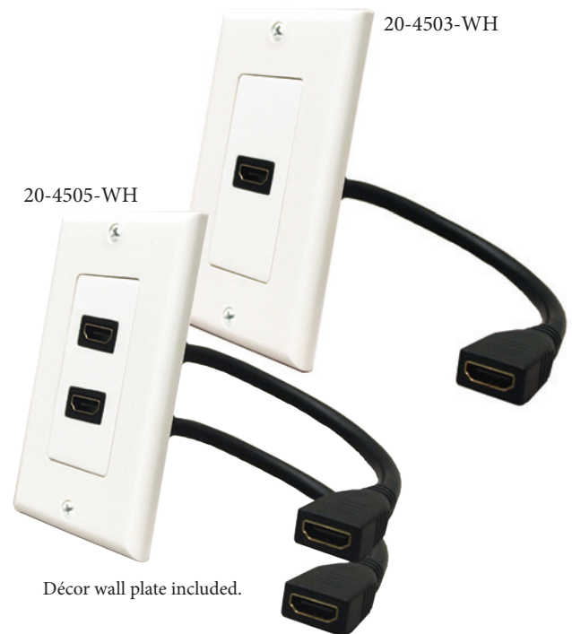
Décor wall plate included.