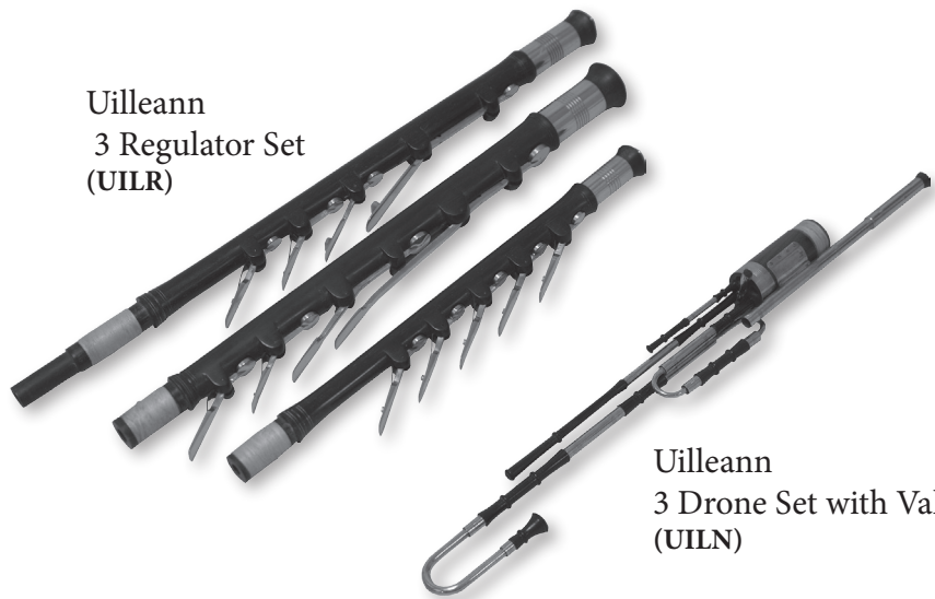
Uilleann 3 Drone Set with Valve (UILN)